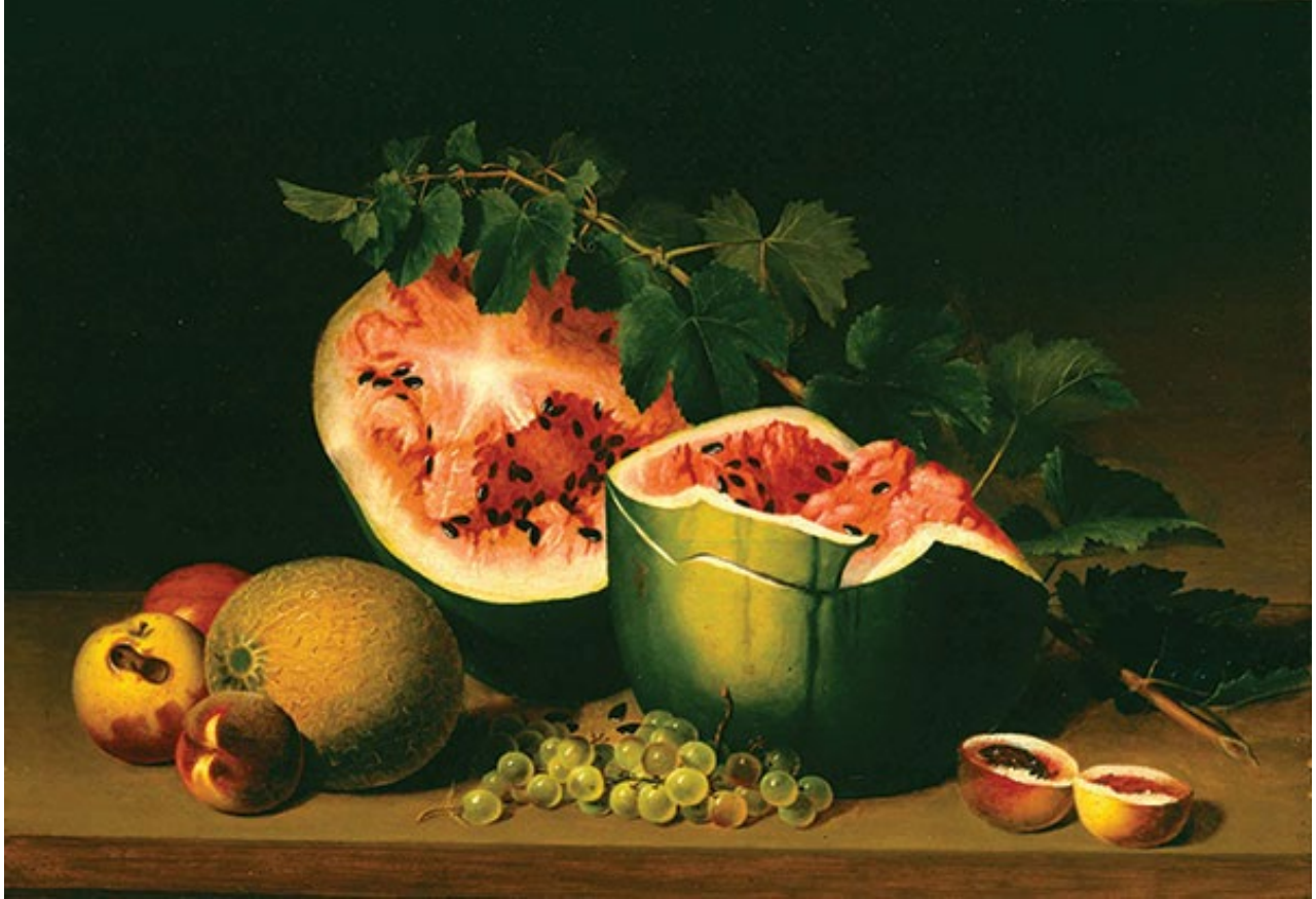
Still Life with Broken Watermelon James Peale (1749–1831) 1825 Oil on Panel Biggs Catalogue, Vol. II, no. 236

In addition to artists who painted portraits, a growing group of U.S. painters were eager to start an American school of art and explore new methods of painting. James Peale and his nephew Raphael Peale (1784–1825) established the first school of still-life paintings in the United States. Although considered one of the lowest forms of painting in the European tradition, still life became a new means of artistic expression in America.