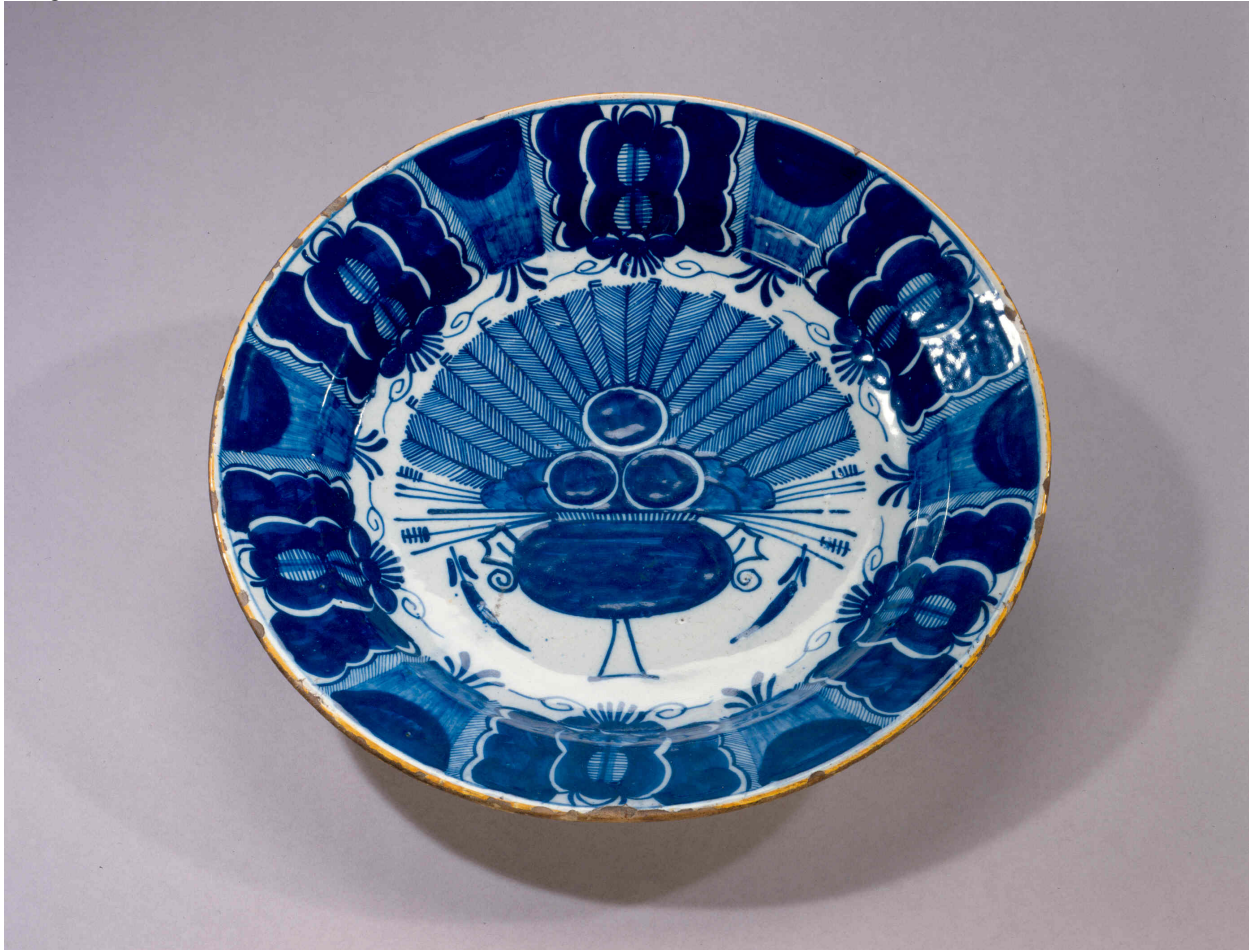
Deep Dish (One of a Pair) Three Bells Factory Delft, Netherlands, 1740-90 Tin-glazed Earthenware

This deep dish decorated in strong blues with a yellow rim conforms to a decorative tradition evident in Chinese porcelains imported by the Dutch East India Company into the Netherlands during the 17 th century. The so-called Wanli wares, named for the emperor of China who lived from 1573 to 1619, were actually non-Imperial, provincial porcelains, yet their quality still amazed avid European buyers. Imitation Wanli earthenware, such as this one, are known by borders divided into panels with motifs suggesting Chinese "clouds." That the border designs of late 18 th century dishes are still recognizable as imitations of early 17 th century wares and that the designs remained popular some 150 years after their introduction is remarkable. The center of this plate shows a stylized peacock's tail or fan above a two handled urn, a motif that appears on other late products of Delft. A hanging hole through the shallow foot ring underscores the role of this pair of plates as wall decoration in addition to food service.